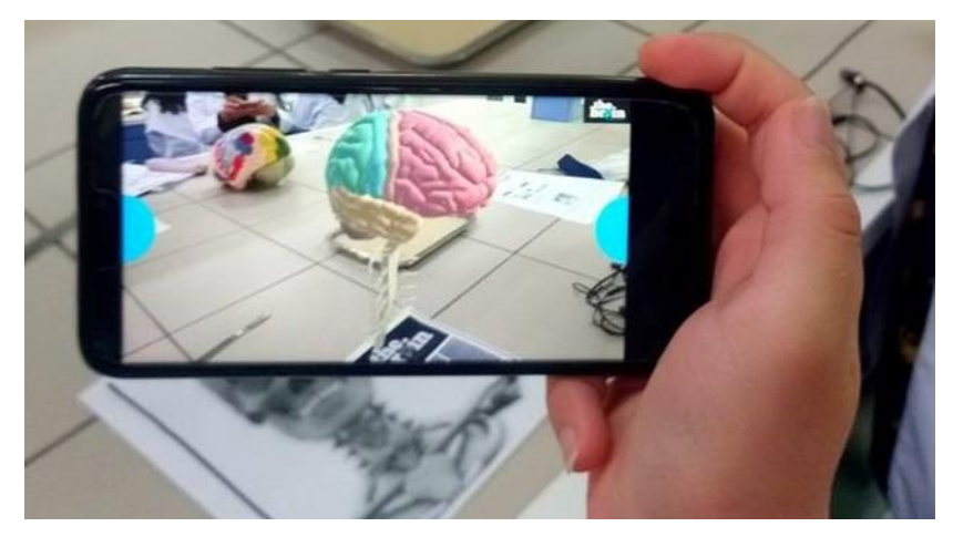
Figure 1. Marker Paper* and MAR Application

(*: The marker paper is pictures or real objects which used to activate visual elements on the mobile device.)