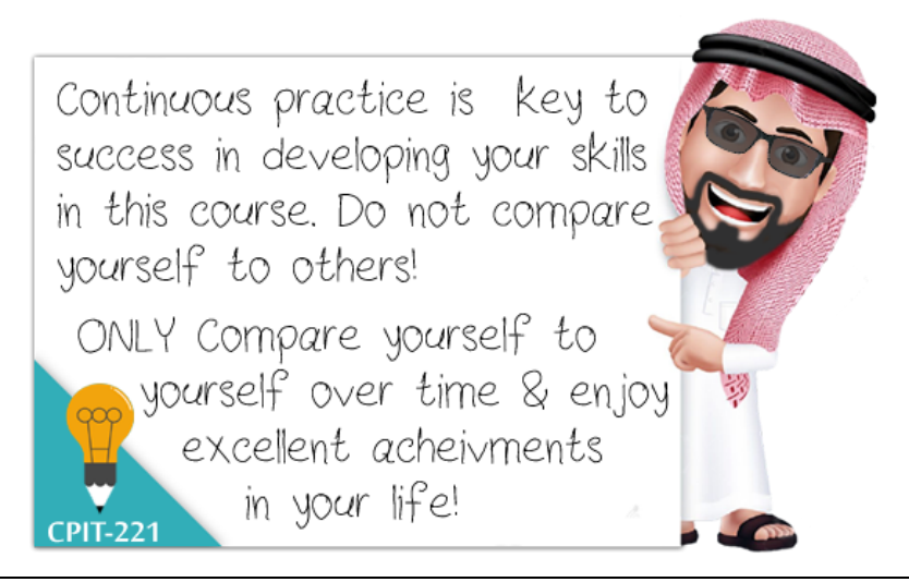
Figure 3. A Motivational Statement Displayed on the Blackboard Course Landing Page

The course has also helped students to be confident with their public speaking skills. While they did not have any in-person public speaking assignments due to COVID-19, they had online assignments such as the make me buy task, which made them more comfortable with their online presence. As one student stated, "This course made me better at socializing. This course made me better at speaking in front of people... [the professors] trained me to be more confident and not to be nervous."