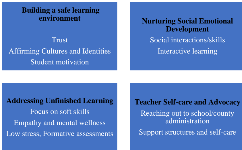
Figure 1. Experiences of Novice Teachers During the Pandemic

shown in Figure 1. Below we elaborate on each one of these themes to showcase teachers' insights on the student learning needs, what worked for them, and the challenges they faced in impacting student learning and development. Each theme had categories that we also expand upon in the following sections.