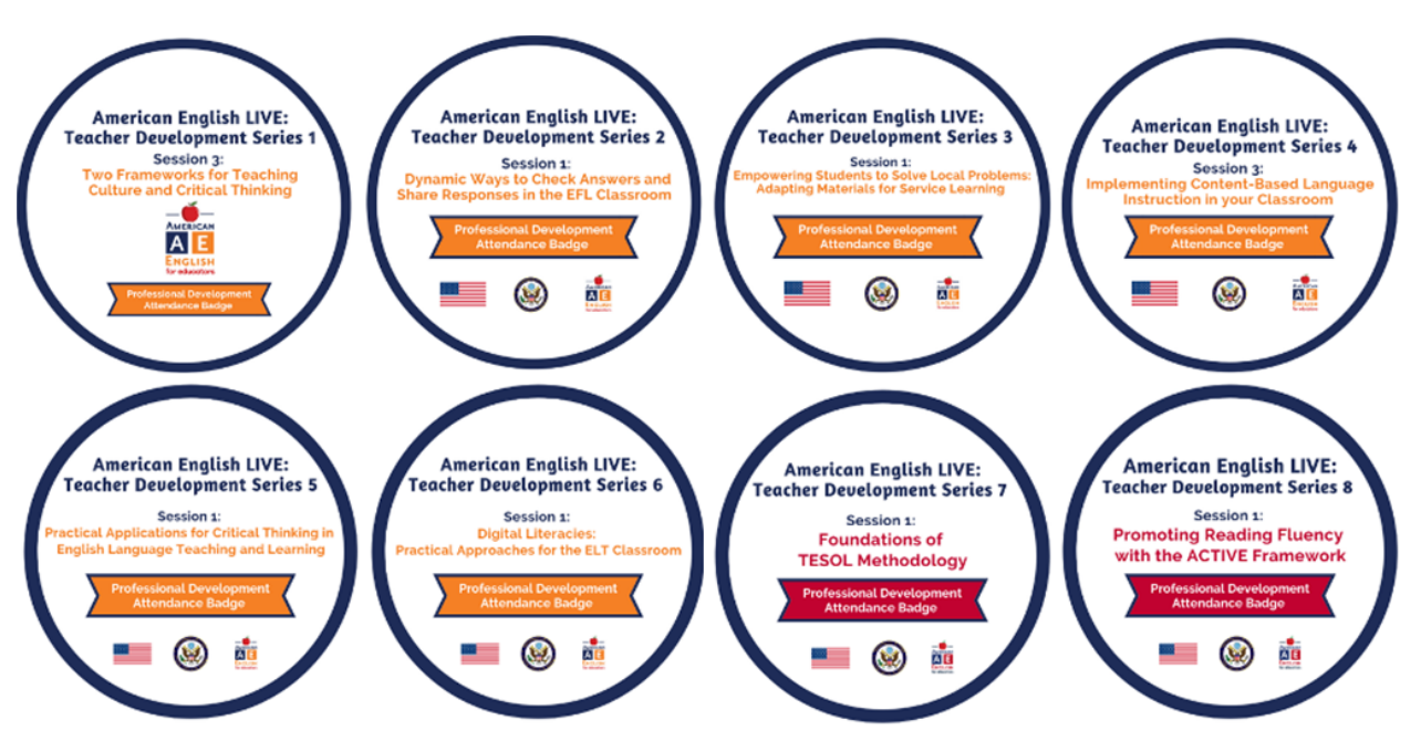
Figure 2. Screenshot of American English Live Webinar Badges