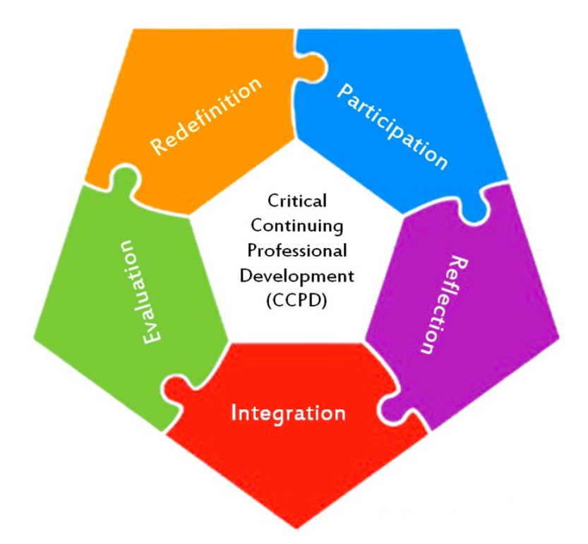
Figure 4. The Critical Continuing Professional Development (CCPD) Framework